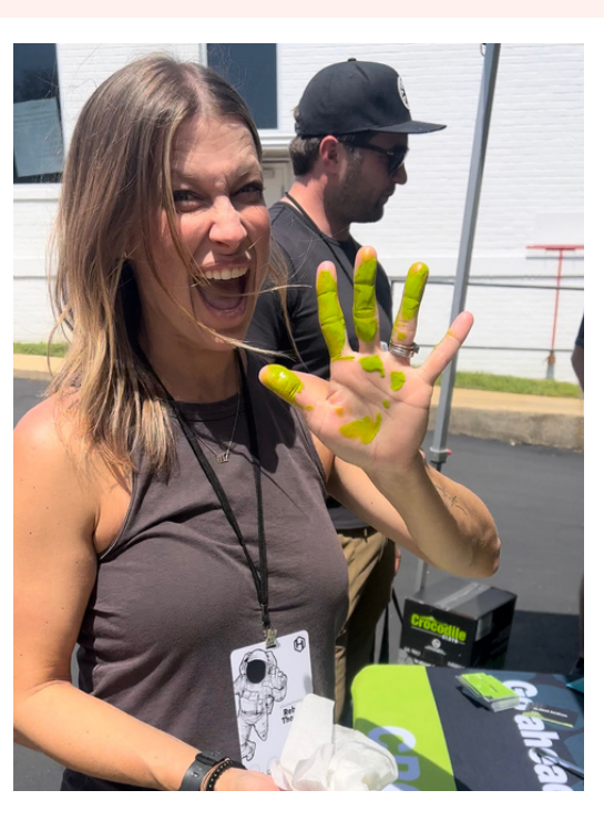
L to R: Bear Woods became the first brand I worked with, starting in January 2022. In March 2023, I refinished an antique record player LIVE at the SurfPrep booth at WorkBenchCon. In April 2023, I attended my first event as a Content Creator, Hardware Huddle.