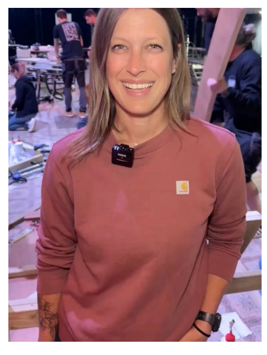
L to R: In July 2023, I was invited to be part of a Bessey NA marketing campaign. In October 2023, I was invited to participate in Philanthromake, sponsored by Rubio Monocoat, Festool, & Shaper. In June 2024, I was invited to the Rubio Monocoat Atelier in Bruges, Belgium.